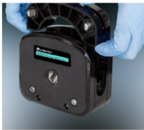
A. Lift both side levers, take off the upper block.