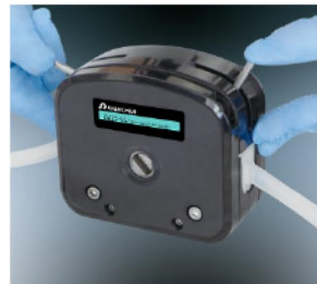
C. Install the upper block, put down the levers to lock the block.