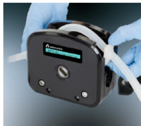
B. Put the tubing with cartridge or connector into pump housing.