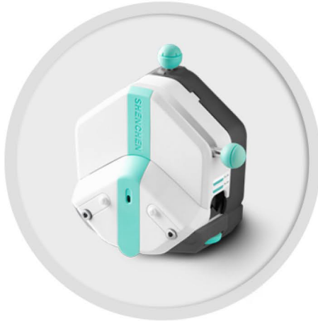
EasyPump Series (Pressure Adjustable)