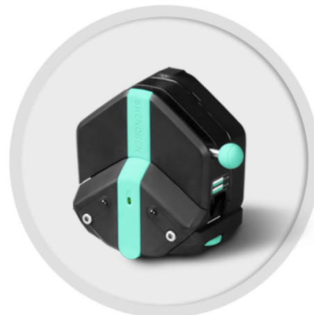
EasyPump-PPS Series (Fixed Pressure)