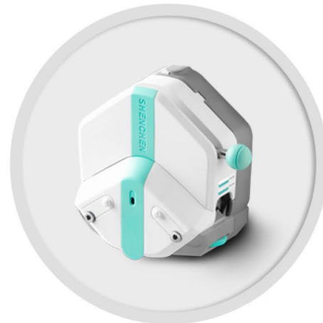
EasyPump Series (Fixed Pressure)