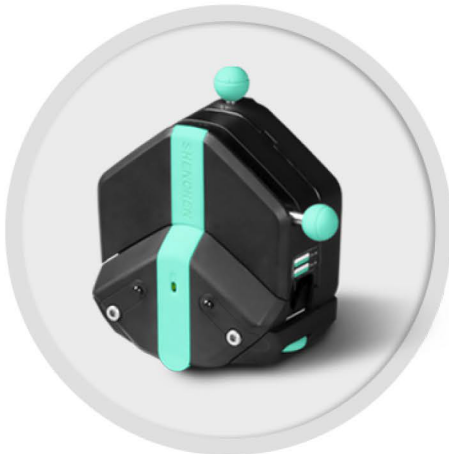
EasyPump-PPS Series (Pressure Adjustable)